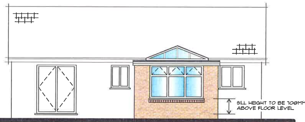
PROPOSED REAR ELEVATION (NORTH)